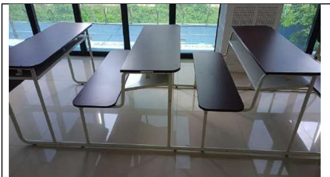
Low Benches & High Benches