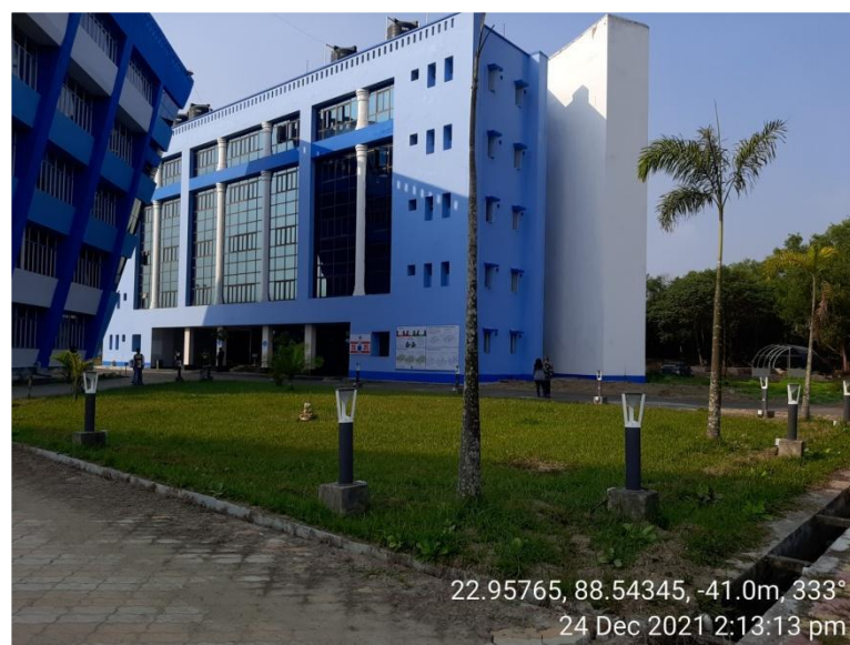
Fig. : 7.1.2.5. : Sensor-based energy conservation at MAKAUT, WB. at Haringhata Campus.