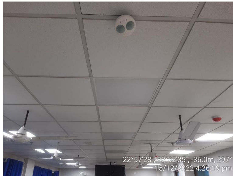
Fig. : 7.1.2.4. : Sensor-based energy conservation at MAKAUT, WB. at Haringhata Campus.